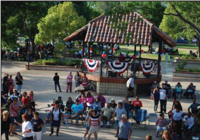
The music of Band of Brothers and Los Pistoleros had folks up and dancing!