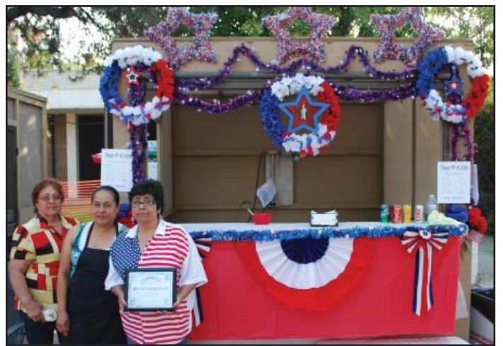
The ladies of the Guadalupanas group won Third Place in the Booth Decorating Contest