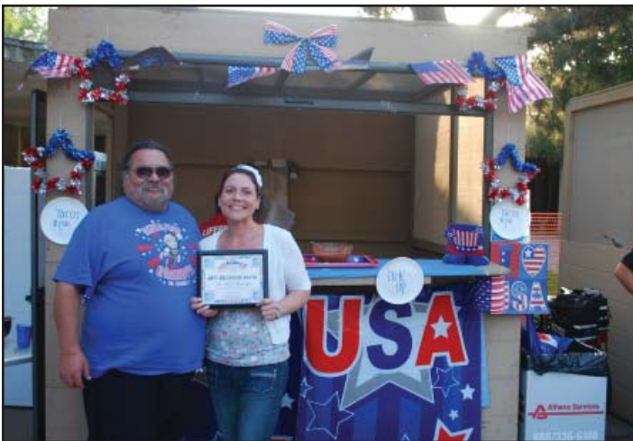
Our Lady of Guadalupe Church placed second in the Booth Decorating Contest.