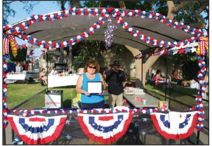
First Place in the Booth Decorating Contest was awarded to the Amvets Womens Auxiliary.