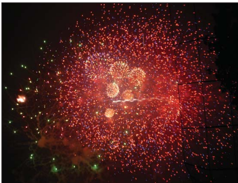
The fireworks spectacular finale - courtesy of our presenting sponsor Ready Pac.